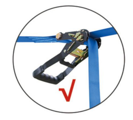
The ratchet is open