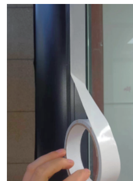
2. Peel off the release paper