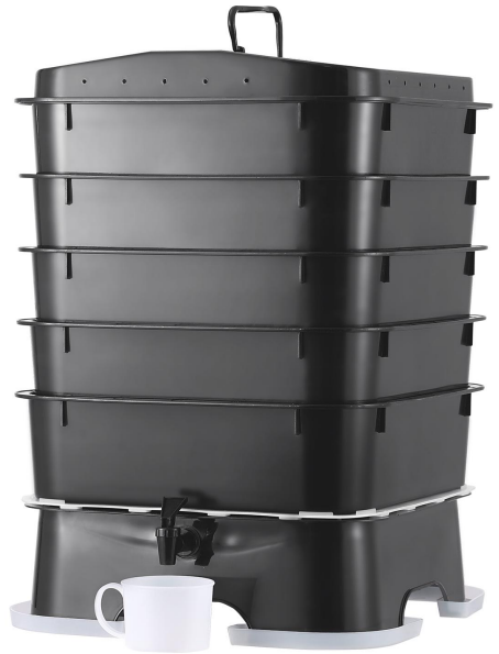
Full load condition