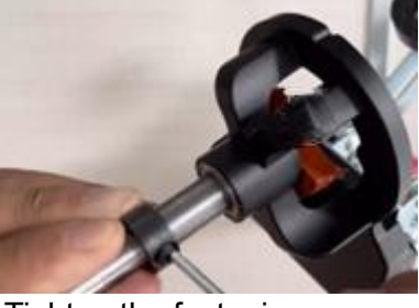
Tighten the fastening screws.

NOTE: Press down slowly and test run by hand after installation.