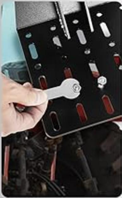
Connect to the vehicle