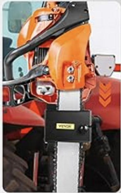
Put in your chainsaw