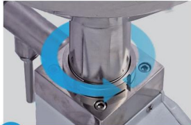
1 Remove The Screw

We recommend that you clean the machine before using it.