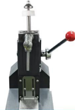
3 Clean the Machine

Hold the base in place, and turn the hopper counterclockwise. Clean the parts of the hopper and the filling nozzle that touch the filling materials, and then install them and the handle, adjust the tray position.