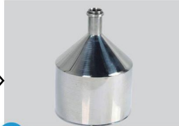
2 Unloading Hopper