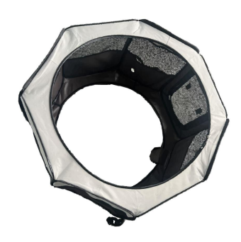
Remove the bottom mat and top cover.