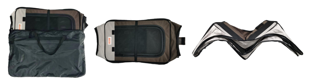
Take the pet playpen out of the bag.

Remove the elastic strap and place the pet playpen vertically on the ground.