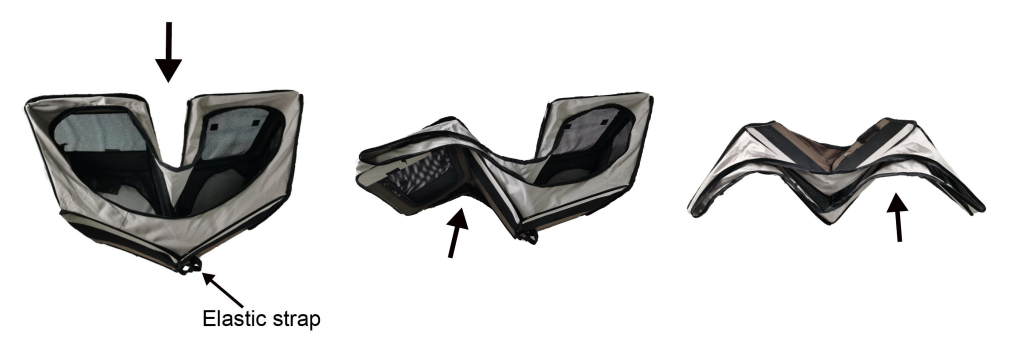
Fold the pet playpen in the direction shown.