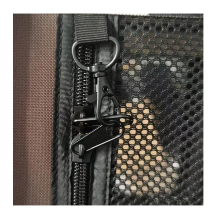
To prevent pets from escaping, use the latch to lock the zipper.