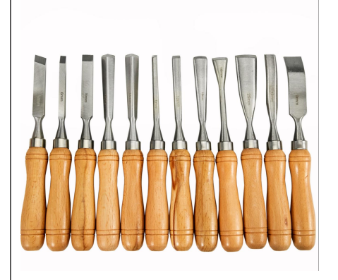
12 PCS Chisels Set Eight blades in different shapes available are sturdy, durable, and easy to use.