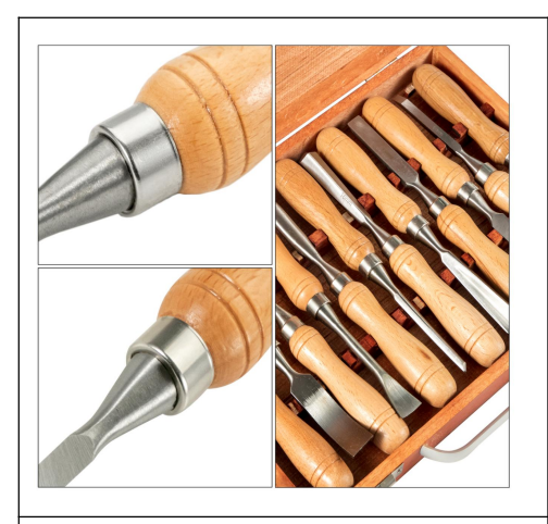
Durable Iron Ferrules Connect blades and handles tightly, ensuring safety during working.