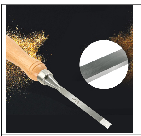
60Cr-V Shrill edge, fine grinding, durable. Blade Length: about 3-3/4" (95 mm).