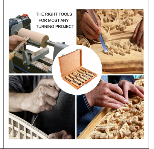
Wide Application It is an ideal kit for woodworking, carving wood carving projects, root carving, furniture carving, lathes, etc.