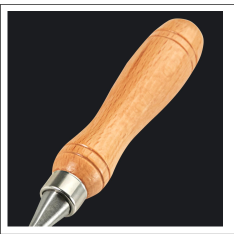
Stained Hardwood Handles mooth surface. They're comfortable to grip.